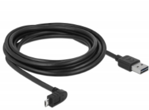
EASY-USB Micro B