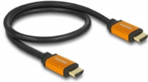
Copper wire with braiding and foil shielding